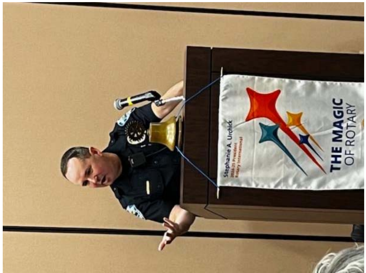
Rotary Club Meeting Feb 11, 2025 Fantasy Springs Event Center